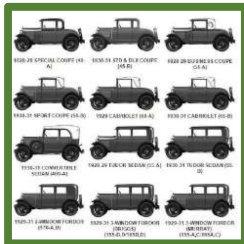
"12 Model A's A-Motoring"